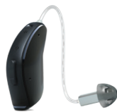
ReSound LiNX 2 62 RIC