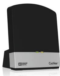
Cochlear TV Streamer (ReSound Unite TV Streamer 2)

The freedom to hear more clearly no matter where you are. Turn the back row into the front row and hear sounds up to 80 feet away with both ears using SMARTstream. The Mini Microphone delivers clearer speech and sound directly to your Nucleus Cochlear Implant and ReSound hearing aid.