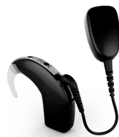
Cochlear™ Baha® 5 SuperPower