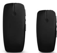
Cochlear Mini Microphone 2 and 2+ (ReSound Micro & Multi-Mic)

Music is the ultimate soundtrack to some of life's truly memorable moments. A flowing melody that mesmerizes you. The steady beat that sways you back and forth on the dance floor at your child's wedding. With the Phone Clip and SMARTstream, you can enjoy the richness and detail of your favorite songs in stereo and wirelessly through both your Nucleus Cochlear Implant and ReSound hearing aid.