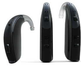
ReSound ENZO 2 ™/ENZO 88 High Power, 98 SP BTE