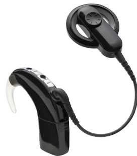
Cochlear™ Nucleus® 6