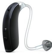
ReSound LiNX 2 77 BTE