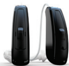
ReSound LiNX 2 /LiNX/LiNX TS™ 61 RIC